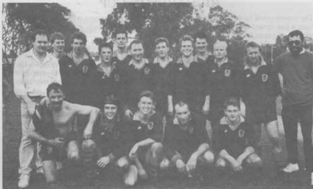
First Grade — BarracloUGH Cup.