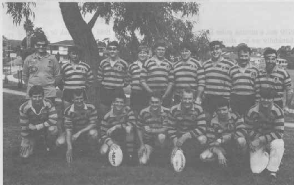
Second Grade — Stockdale Cup.